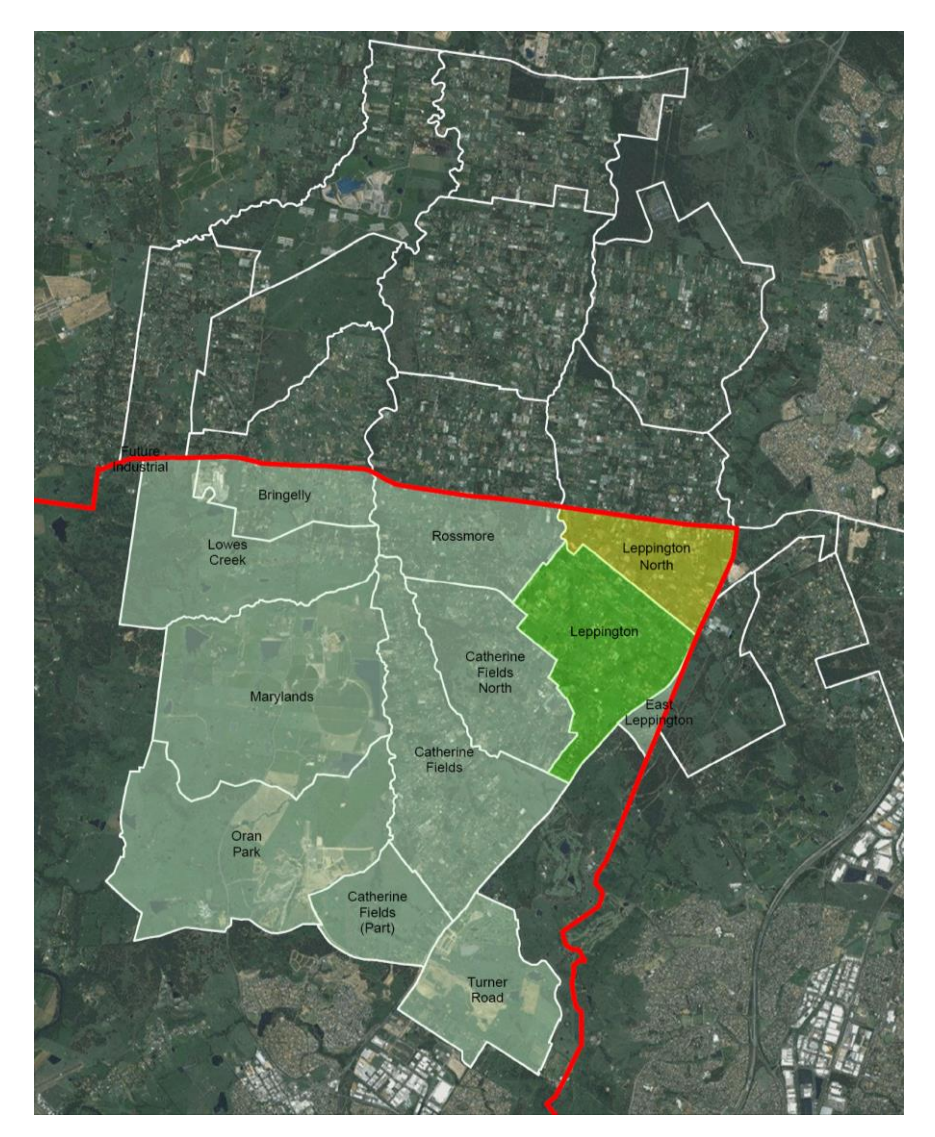
Figure 1 South West Priority Growth Area precincts in Camden LGA

Figure 1 shows the location of these development precincts, the names of the precincts situated in the Camden LGA, and the precincts covered by this contributions plan (i.e. Leppington and Leppington North).