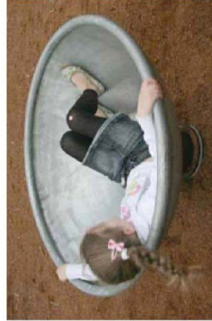
DISH SPINNER (MODUPLAY)