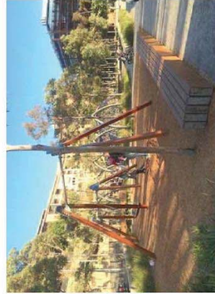
PREMIUM (TIMBER) DOUBLE SWING (MODUPLAY)