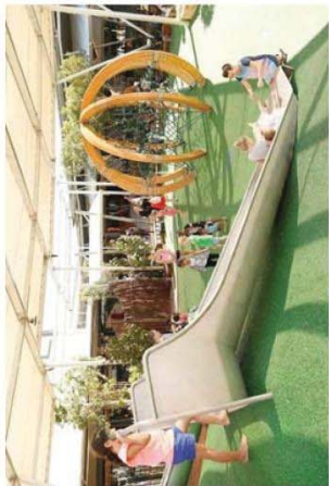
SLIDE BEDWAY 1.8M (KAISER AND KUHN)