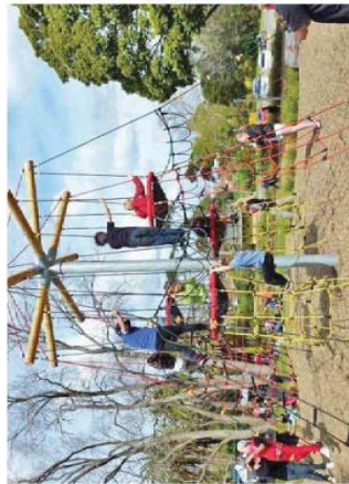
MULTI-PLAY PIECE - 6M EAGLES NEST (PLAYGROUND CENTRE)