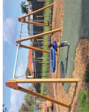
PREMIUM (TIMBER) COMBO NEST SWING (MODUPLAY)