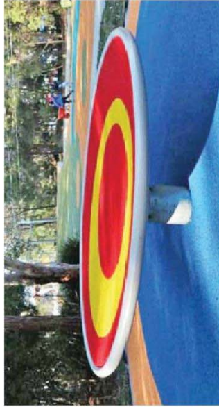
PLATO SPINNER (MODUPLAY)