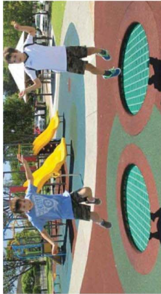
TRAMPOLINE P1 - 1.5M DIAMETER (MODUPLAY)