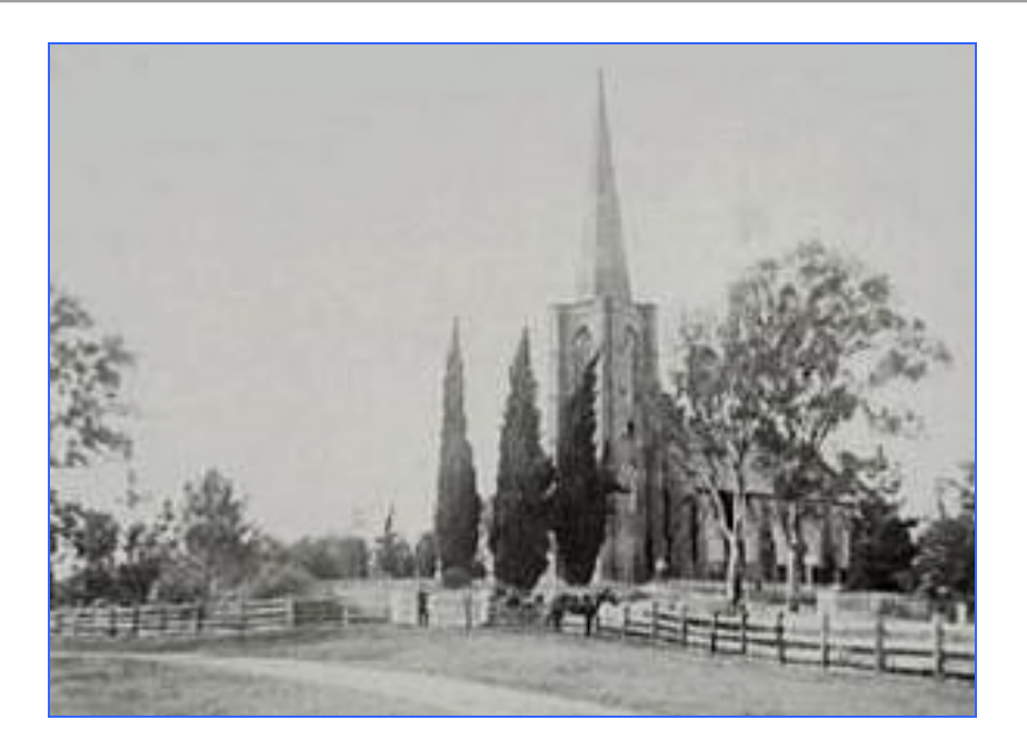
Figure A – A photograph of St John's Anglican Church, Camden taken by 1896 shows that a pair of Forest Red Gums ( Eucalyptus tereticornis ) (right), remnants of the original woodland, were large specimens even at this time. The same trees are still thriving on the site. One large Pencil Pine ( Cupressus sempervirens ) remains from this planted group in front of the church. The immature Monterey Pines ( Pinus radiator ) (left) were possibly removed at a latter date.