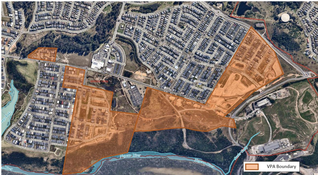
Figure 1: Development Boundary

The Planning Agreement covers AV Jennings' (the Developer) development in Spring Farm. The development is being delivered across 14 stages spanning the area shown in Figure 1. The development is expected to yield approximately 817 residential lots.