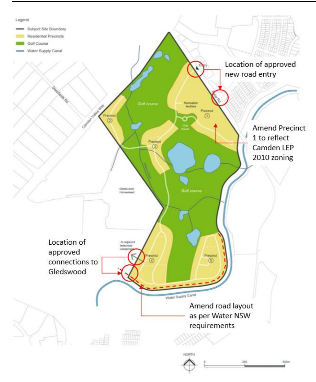
Figure 2: Summary of proposed amendments to Camden Lakeside DCP figures