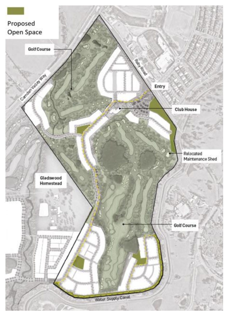
Figure 3: Camden Lakeside - Revised Open Space