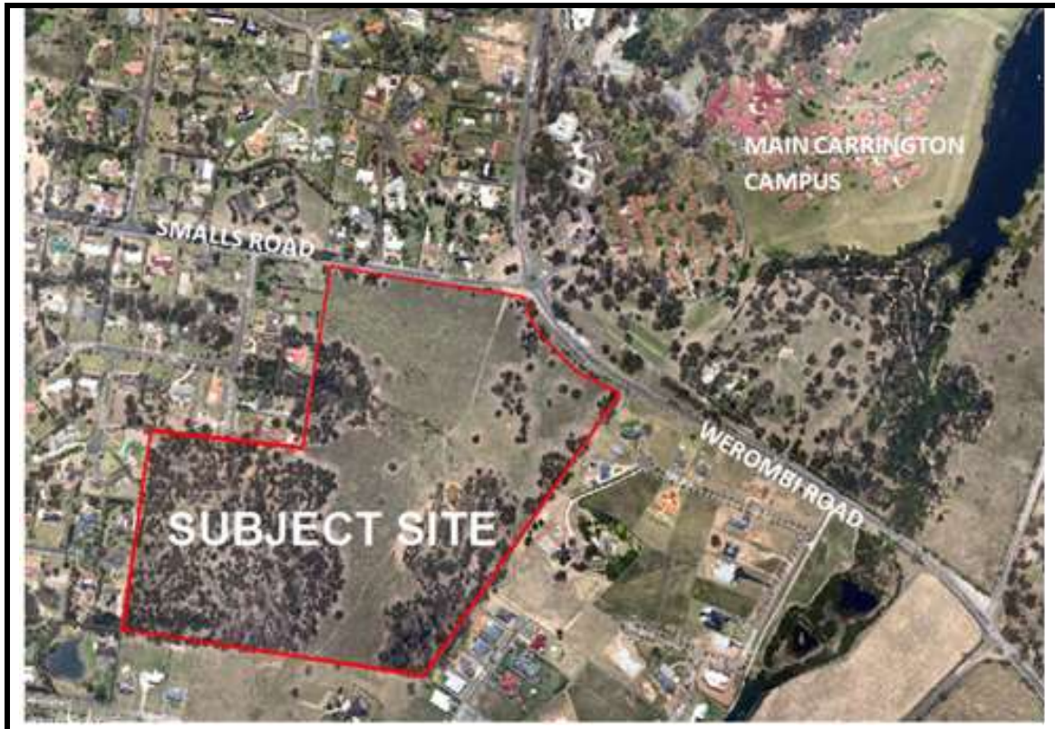
Figure 1: Subject Site

At its meeting of 10 April 2012, Council considered the draft Planning Proposal and resolved to: