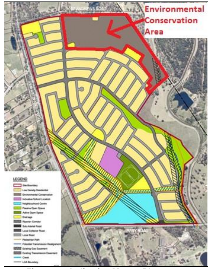
Figure 1 - Indicative Master Plan

Previous development consents have approved the removal of vegetation from the Emerald Hills Estate outside of the conservation area with the remaining vegetation located adjacent to Camden Valley Way proposed to be removed as part of this application.