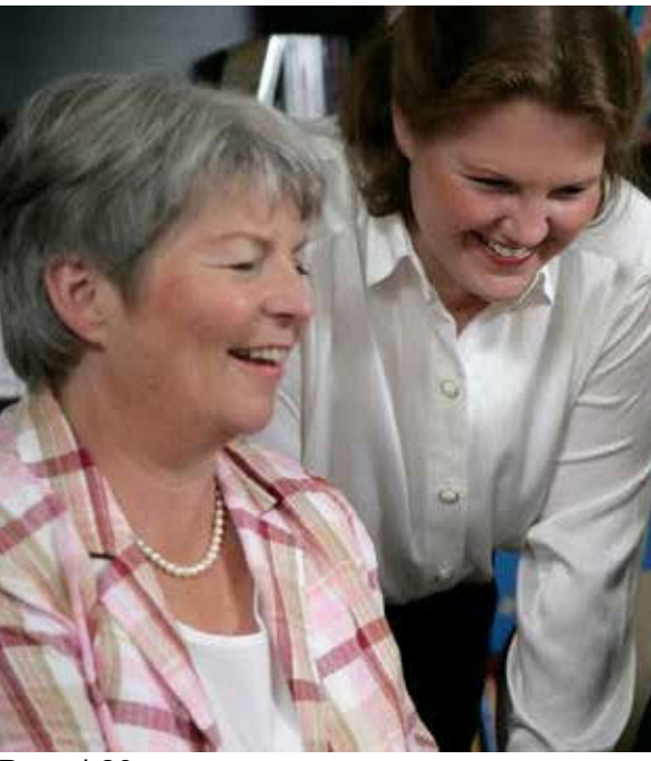
Page | 29