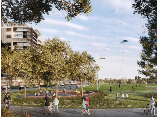
Aerotropolis Precinct Plan artist's impression – Thompsons Creek Regional Park.

As part of the preparation work, the Ministry of Health and South Western Sydney LHD (SWSLHD) are currently developing the clinical services framework for the region, taking into consideration the projected population increases.