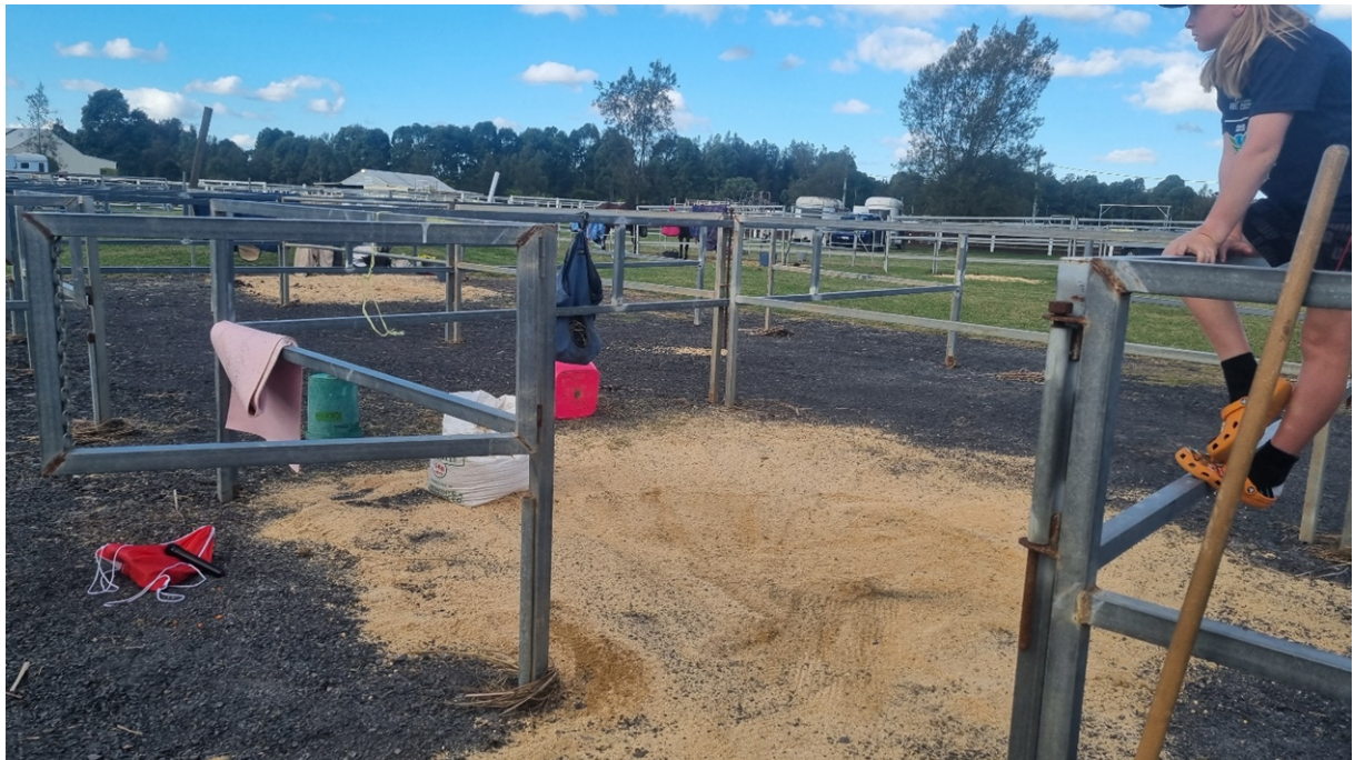
Photo Cobbitty Camp – virtually impossible to get the smaller shavings. Organisers need to advise their competitors that shovels are compulsory equipment, even better if BYO own rubber matting