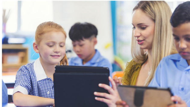
The NSW government will spend $2.6 billion on four new schools and major school infrastructure upgrades this coming financial year.

Premier Chris Minns said it was critical to build new schools in the state's rapidly growing regions.