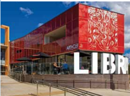
The new ARTyCaf at Narellan Library