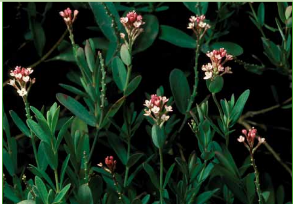
Pimelea spicata – both photos Jaime Plaza DECCW

In light of the drastic plight of many threatened plant species across Australia, Camden Council and Mount Annan Botanic Garden are delighted to advise that a rare plant has been found to be thriving at a site in Narellan. This is also particularly pleasing given that 2010 is the United Nations International Year of Biodiversity.