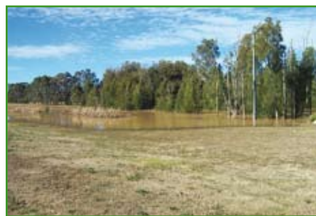
Stage 1 Before Construction

The wetland systems will take 2-3 years to establish and become fully functional, however they are already contributing to improved water quality in the Nepean River. Council is currently constructing a Flood Bypass Channel immediately downstream of Camden Valley Way to further manage the risk of flood in the area.