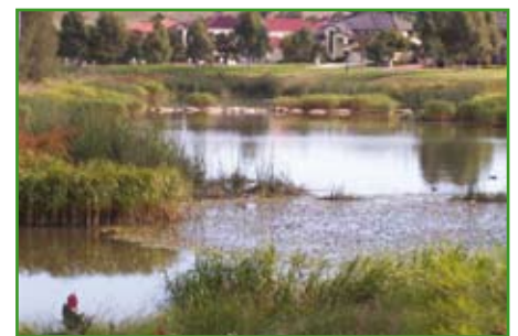
Stage 1 After Construction