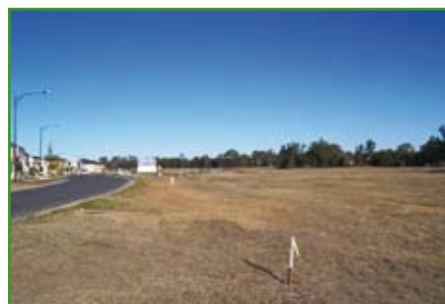
Stage 2 Before Construction