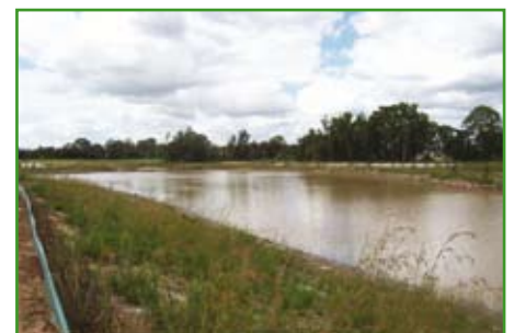
Stage 2 After Construction