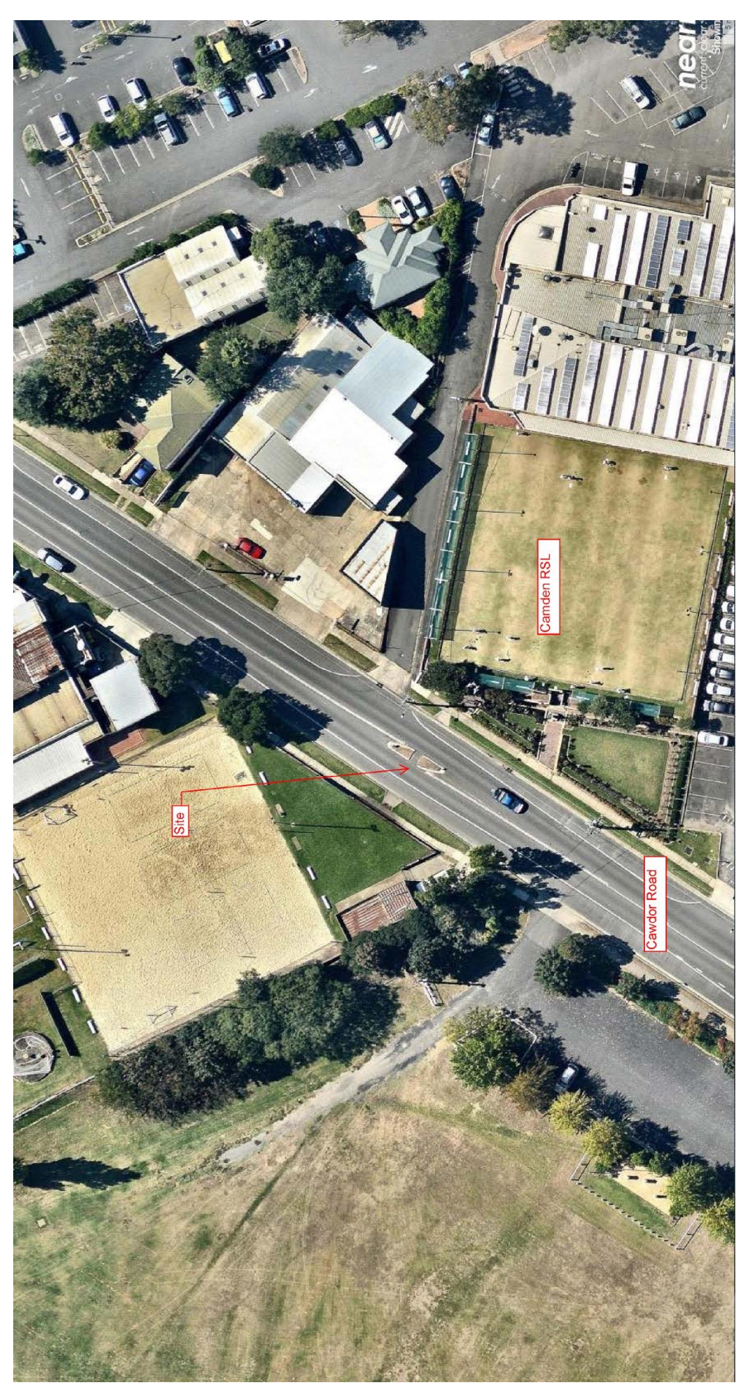
This is the report submitted to the Local Traffic Committee held on 19 July 2016 - Page 9