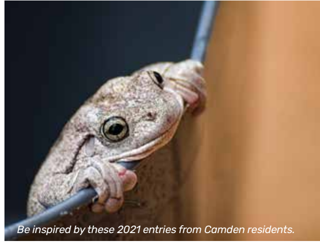
Be inspired by these 2021 entries from Camden residents.