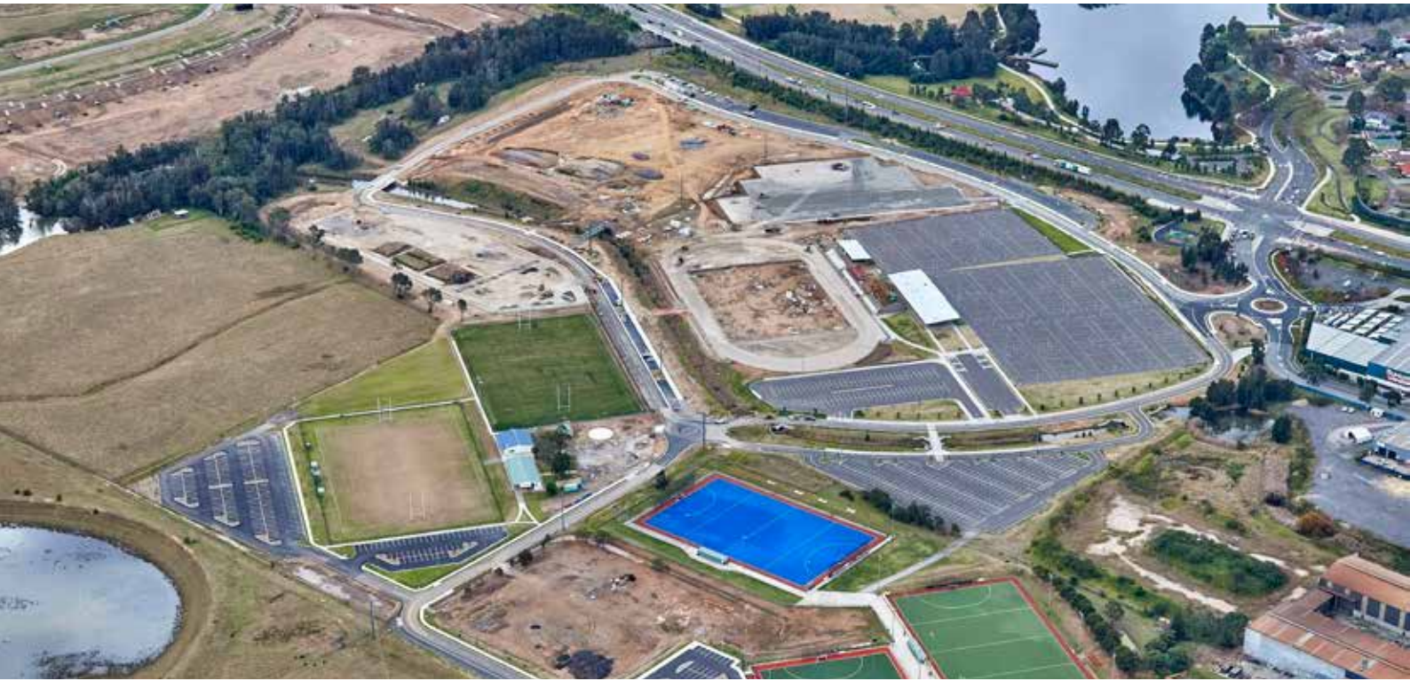
Construction continues at Narellan Sports Hub