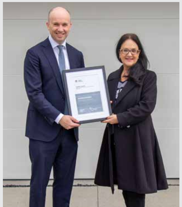
NSW Minister for Energy and Environment, Matthew Kean, presenting the silver status award to Mayor Therese Fedeli.

The solar systems will help to reduce electricity costs at these important community facilities by providing green energy. The new systems will complement existing solar systems installed at five other Council facilities, with a combined capacity of over 360 kilowatts.