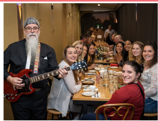
Live music performance at Upstairs at Freds as part of the Jacaranda Festival.