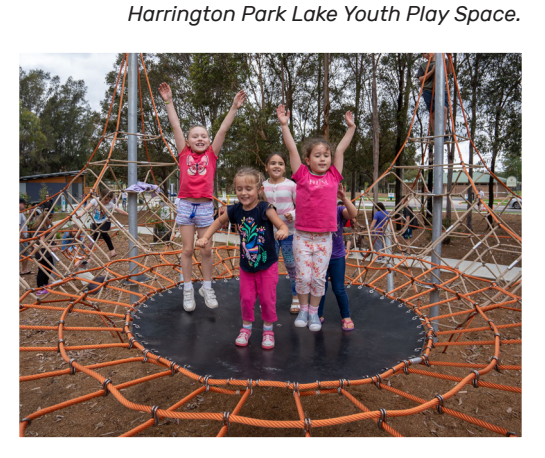
Sedgwick Reserve Youth Play Space.

For more information go to www.camden.nsw.gov.au