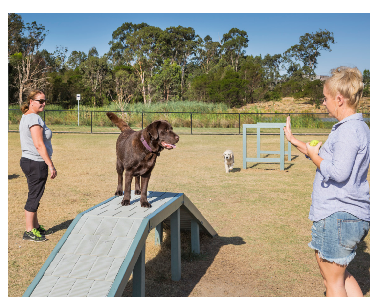
Off-leash dog park Burrell Road, Spring Farm.

Remember: When you're taking your dog for a walk, your pet MUST be on a lead for the safety of everyone in our community.