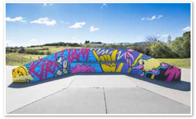
Kirkham Skate Park