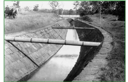
Gregory Hills Drive - Badgally Road Extension