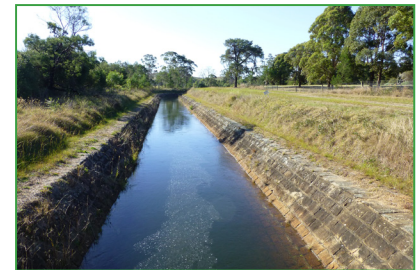
Upper Canal - The Australian Botanic Garden, Mount Annan