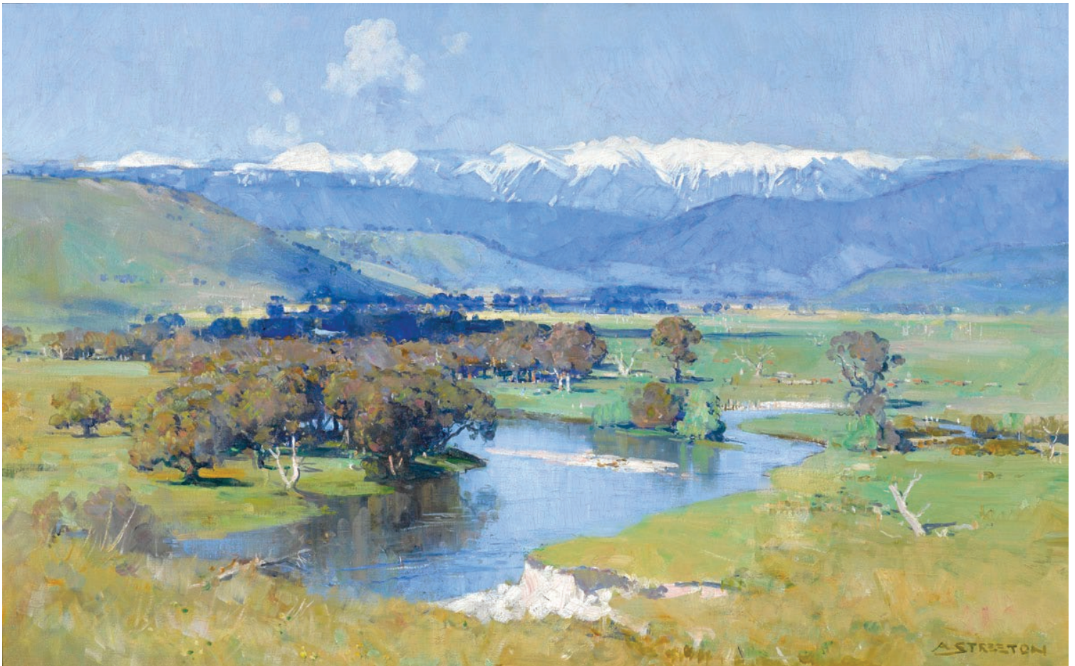
(1867-1943) Artist Arthur Streeton The Murray and the Mountain (1930) oil on canvas 64 x 102 cm signed 'A STREETON' lower right-